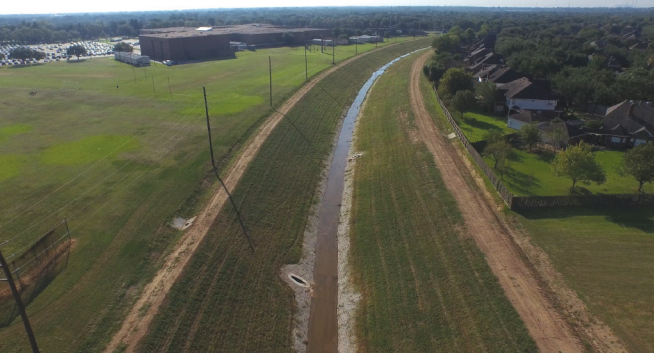
Ditch "G" completed

Beginning in late 2014, Fort Bend County Levee Improvement District No. 2 (LID #2) started a large capital improvement project within the community. As shown on the map below, the project will impact Ditches "A", "D", and "G" which drain storm water runoff for a large portion of First Colony. The project will rehabilitate the ditch bottoms while implementing new design techniques that will prevent future erosion and improve slope stability within these channels. All work performed during the project is conducted under the United States Army Corps of Engineers Section 404 permit.