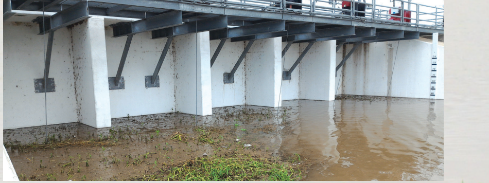
May 29: Brazos River Elevation 48.5 feet

West Levee/Ditch A Outfall structure during emergency operations