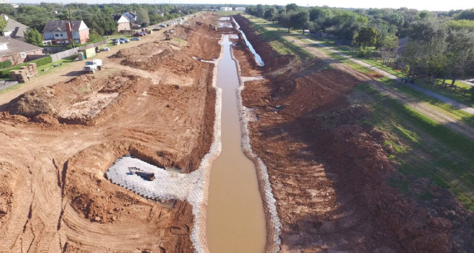
Ditch "A" during construction

The contractor is currently working on the section of Ditch "A" between the two crossings of Sweetwater Boulevard. The first crossing is near Colony Meadows Elementary/Clements High School and the second is near St. Lawrence Catholic Church. The southern side of the ditch contains a trail that is used by many residents for recreation and as a route to school. Currently, the majority of construction activity will take place on the north side of the ditch and not impact the trail. However, all trail users should be aware of nearby construction activity, including the replacement of several storm sewer inlets on the south side of the ditch near the trail. LID #2 right-of-way does extend past the top of the ditch bank and the public should avoid entering any active construction areas.